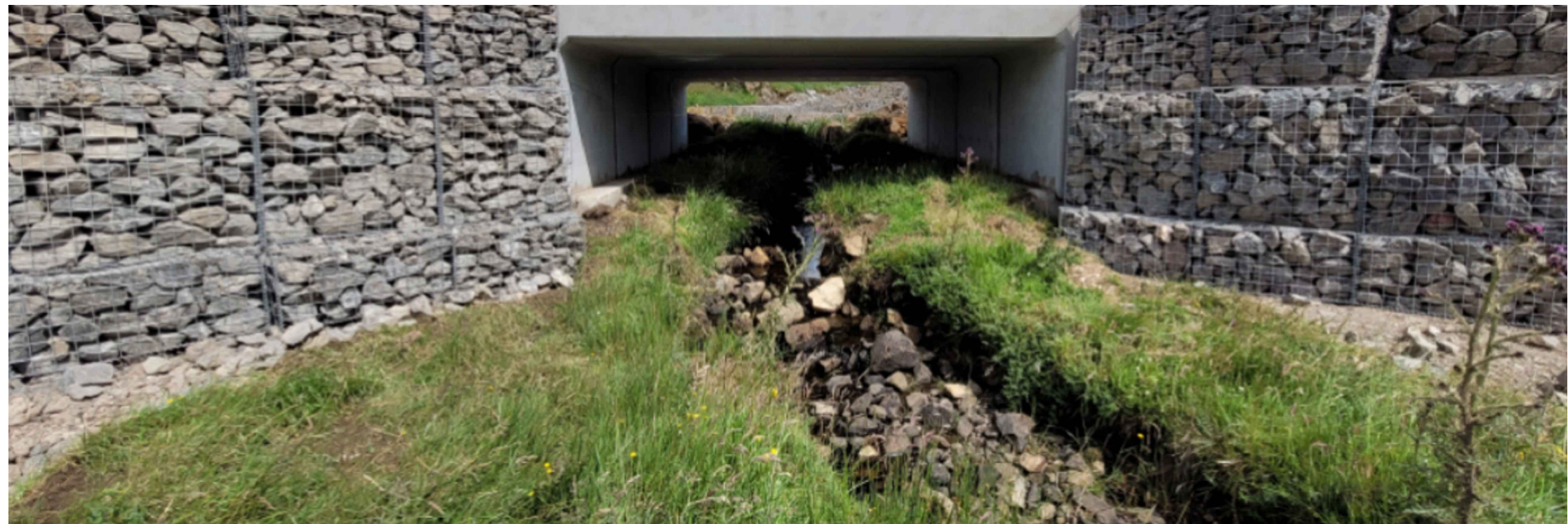
BOTTOMLESS BOX CULVERT CROSSING