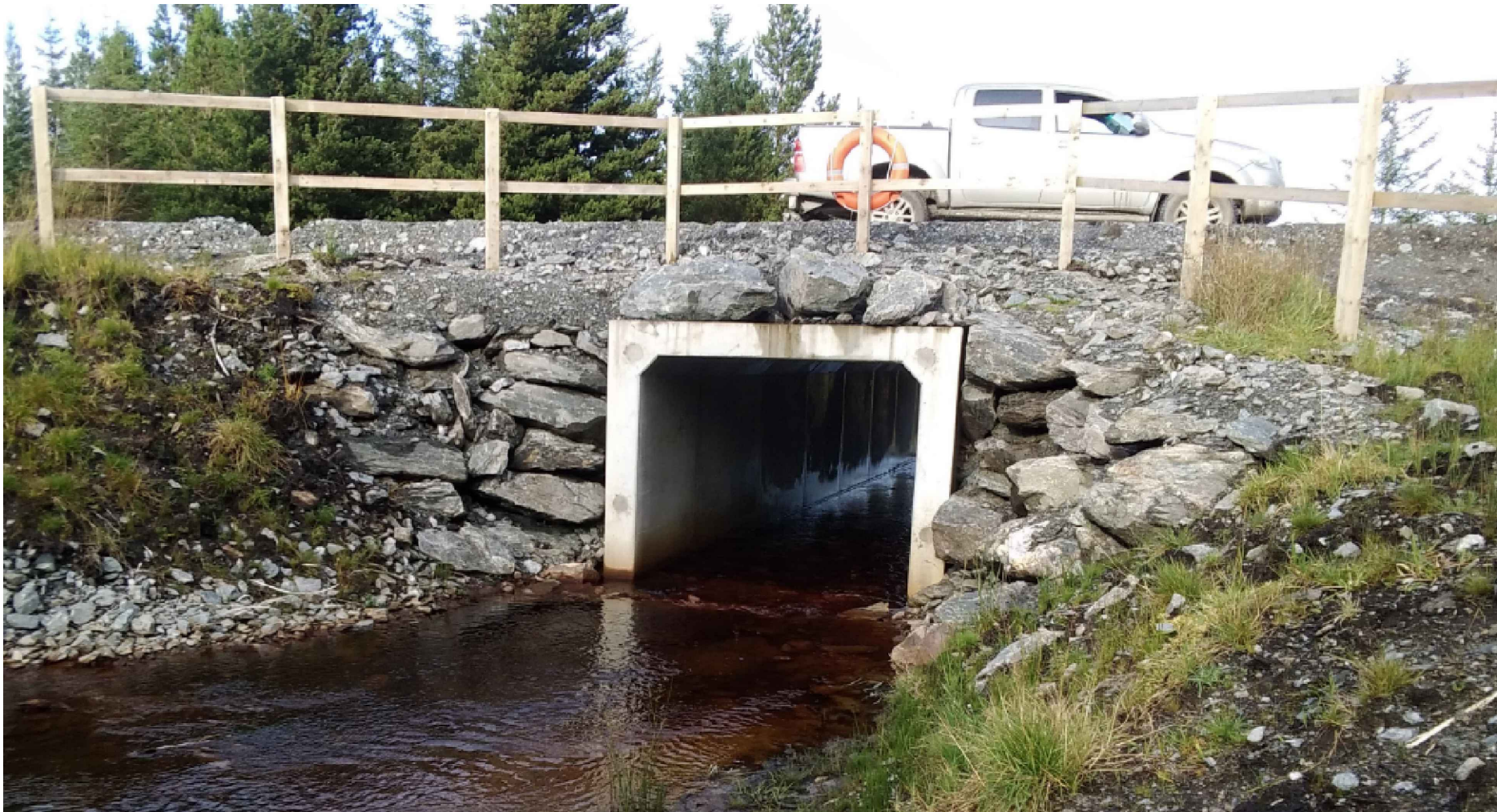
BOX CULVERT CROSSING